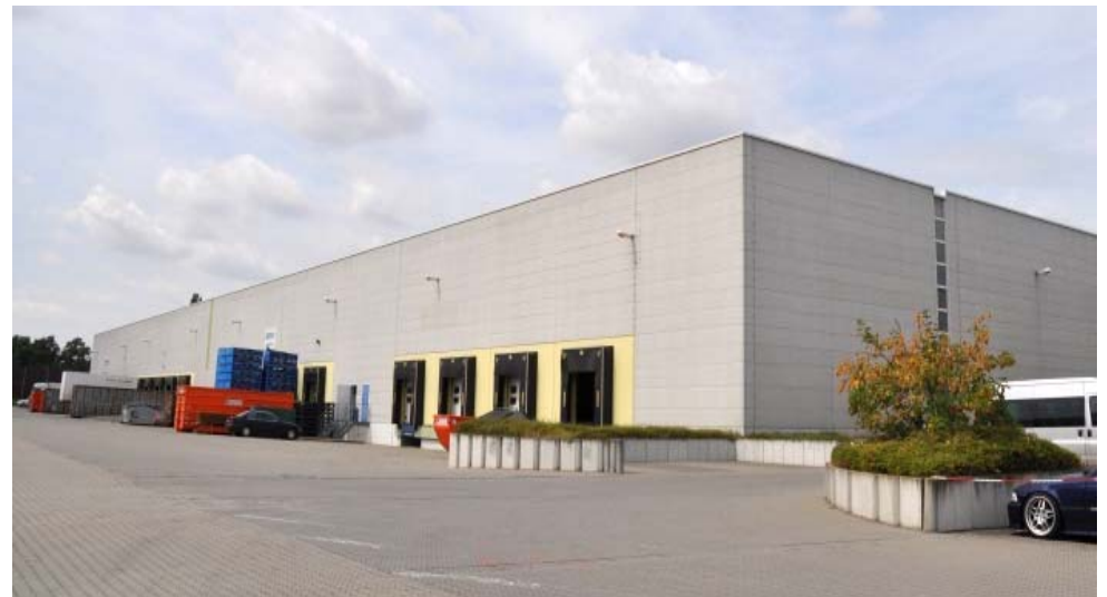
Delta Forum, Gustavsburg, Germany