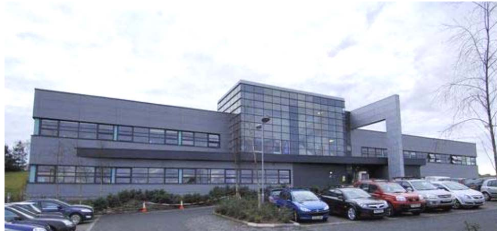
Earn House, Perth, Scotland