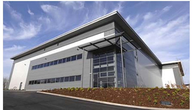
Vernon House, Wolverhampton