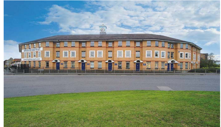
Farnham Road, Slough